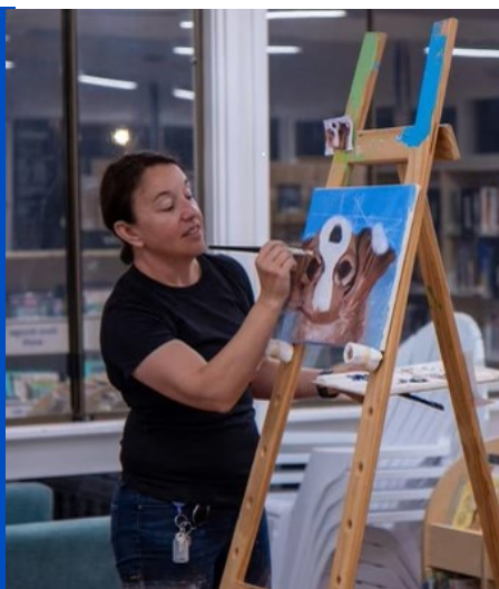
Facebook: Helene Ruma Art Gallery