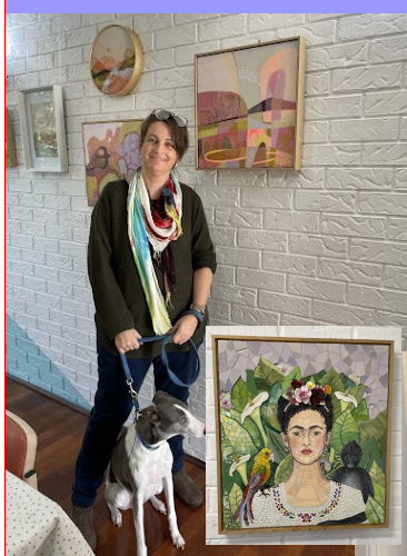
Flying Spanners Gallery, Teralba