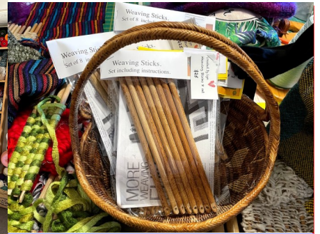
Fibre Artists Plus, Dora Creek