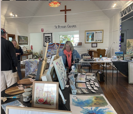
ARTea's Gallery (& St Peter's Chapel), Swansea