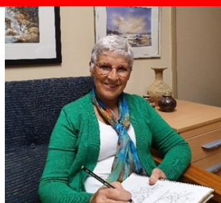
OCTOBER Marlene Palagyi, Watercolour