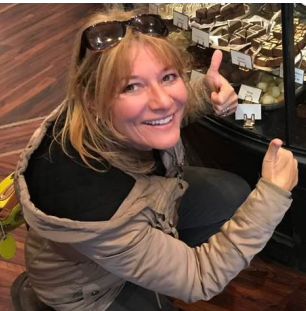
APRIL 2023 Pen Shephard Oils/Miniatures