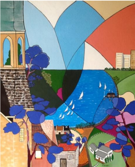
Jacaranda Time – Acrylic – 51 x 61cm $250