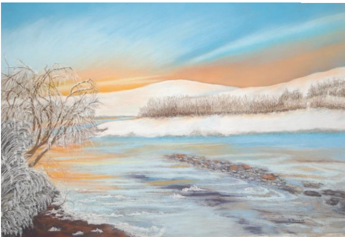
Melting Snow - Pastel - Framed 81 x 61cm $320