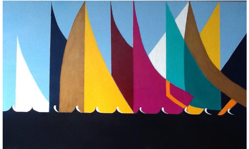
Sails - Acrylic 80 x 40cm $200