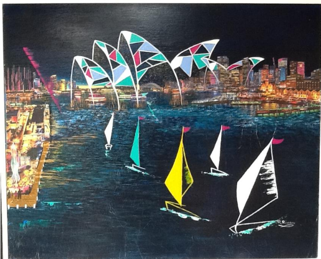
Vivid-Sydney - Acrylic/collage 52 x 42cm $200